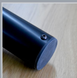
Pole end with bolt

Too much force may cause permanent damage to the base and/or cause water leaks. If you feel any resistance while inserting the pole, stop immediately and revisit the instructions above, or contact us.