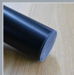
Pole end without bolt