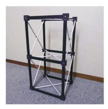
2 Insert the 8 Channel Bar A vertically, to both the front and back of the frame. Start by slotting point end inside upper hub first.