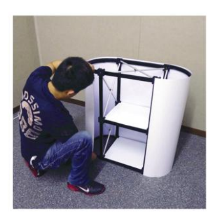
Attach your graphic panel. Starting from one end, keep it level with the horizontal channel bars.