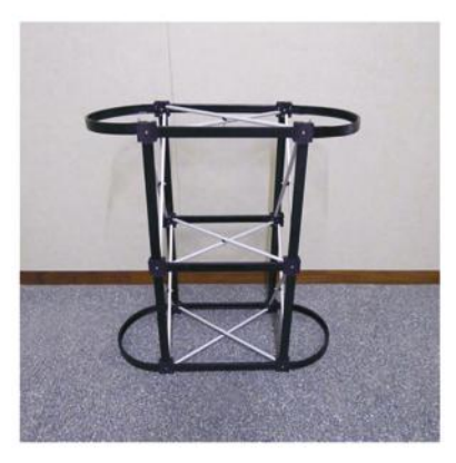
Insert the 4 Channel Bar C to a 4 corner as a curved. Once all channel bars are attached, insert the internal wooden shelves, placing them on top of the hubs.