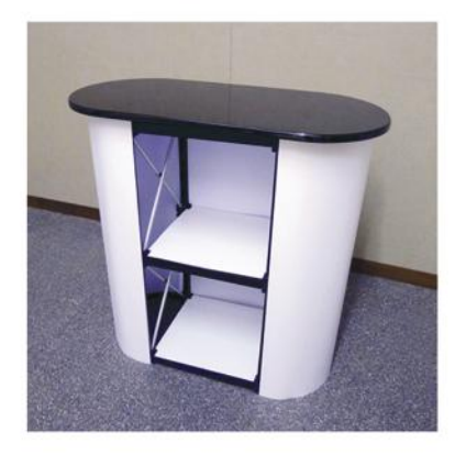
Insert and secure the shelves into the center of the aluminium frame.