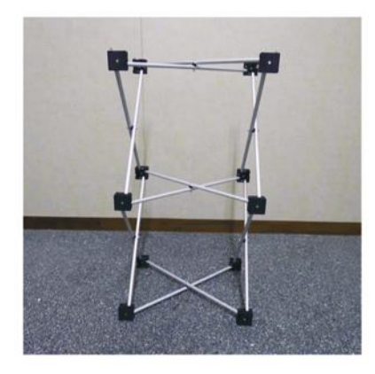
Open up theframe keeping the hubs with steel pins facing up.