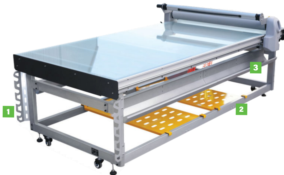
1. Roll Holders