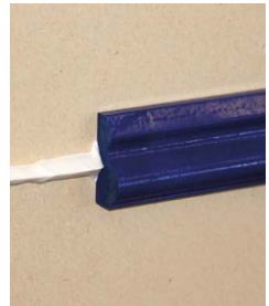
Even wall trims, position and go