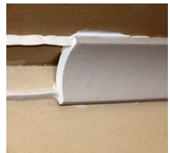
No more nails, screws, props, disasters and time... ritack makes installing cornices easy