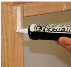
What makes installing fastwall faster than fast... you guessed it, Ritack!