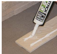
Applying ritack in stripes on tiles.