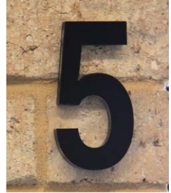
Place that sign or letter where you want it with confidence that where it will stay... no fixings needed!