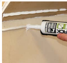
2 beads is all it takes!