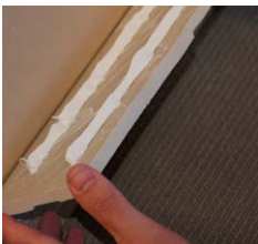
Tiling becomes a breeze with ritack.