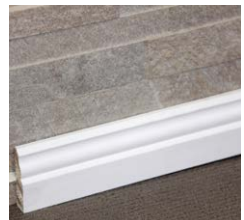
Making skirting boards easy to install