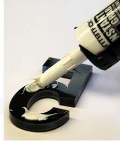
Apply the adhesive as required... beats drilling and screwing any day!