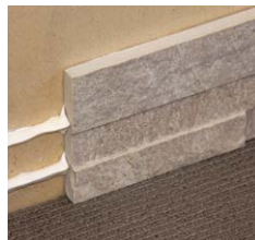
Place tiles in position then with a push you walk away - couldnt be easier!