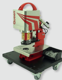
Queen with wheels