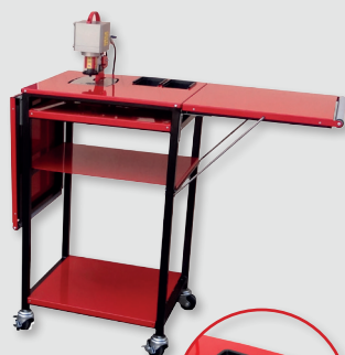
Queen with table